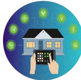
SMART HOME FEATURES