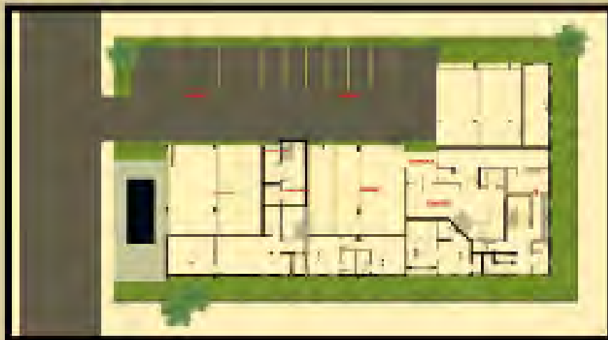
Ground Floor Layout