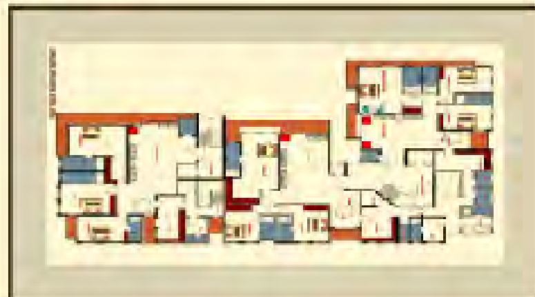
Fourth Floor Layout