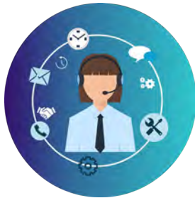
FULLY SERVICED APARTMENT