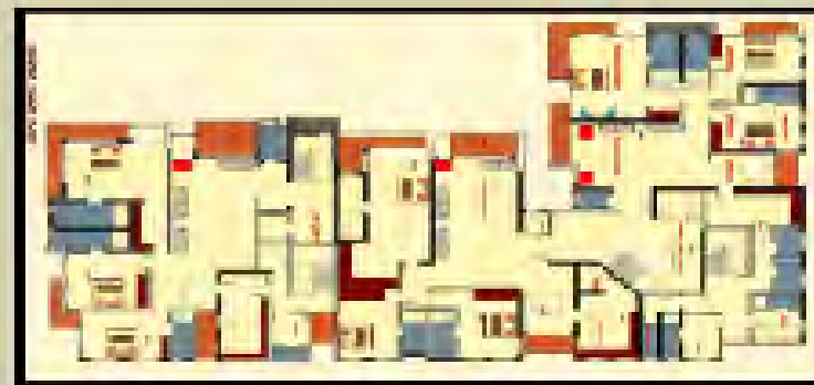
Typical Second & Third Layout