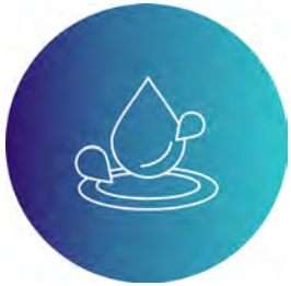
TREATED 24/7 WATER SUPPLY